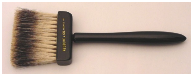
SERIES 31S—FRENCH BADGER BLENDER SIZE 3" $75.00