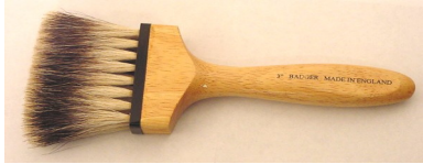
SERIES 31A—ENGLISH BADGER BLENDER PRICES EACH SIZE 3" $225.00