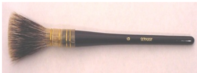
SERIES 32—GERMAN ROUND BADGER BLENDER PRICE EACH SIZE 6 $30.00